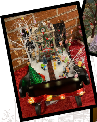
Vignettes Created by V.A.A. Members